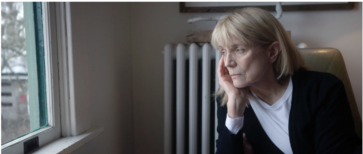
Harley Jane Kozak as Lynn timer