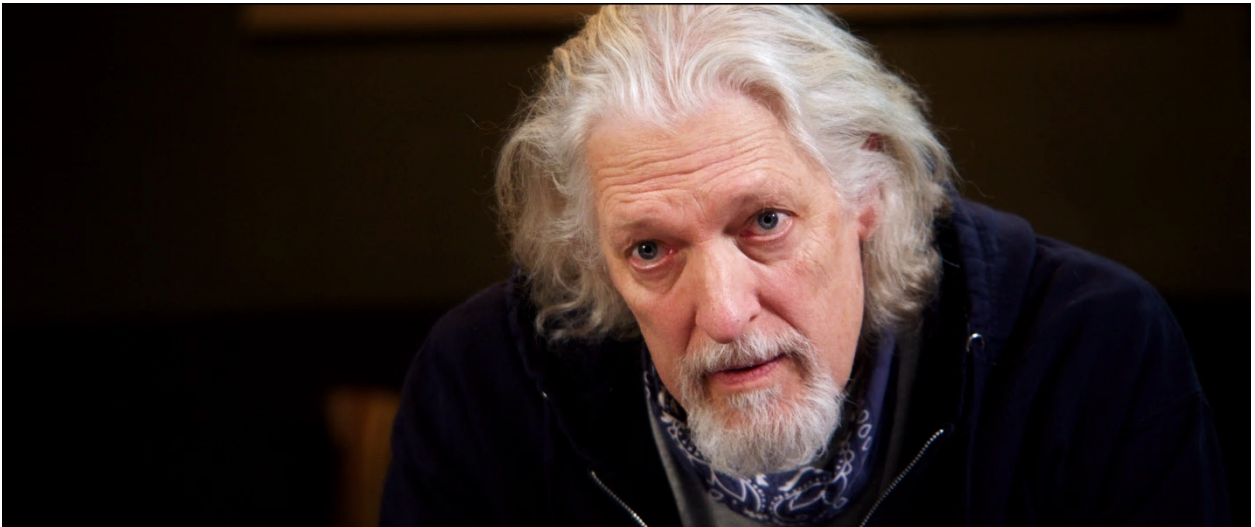
CLANCY BROWN as Riz the Director