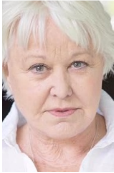
SUSAN RUTTAN – Dr. Winter

Susan is a recognized industry veteran, currently appearing on A Man on the Inside with Ted Danson on Netflix. She has been nominated for 4 Primetime Emmy awards and 2 Golden Globe awards.