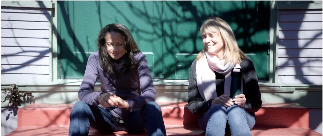
ANNE-MARIE JOHNSON as Jo and HARLEY JANE KOZAK as Lynn