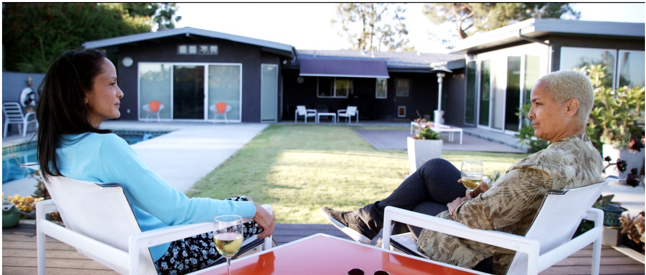
L-R: ANNE-MARIE JOHNSON as Jo and Shari BELAFONTE as Charisse