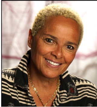
SHARI BELAFONTE – Charisse

On the big screen, Alan has appeared in The Wanderers , The Last Temptation of Christ and, as a very skewed version of himself, in Frankie and Johnny Are Married . Alan served as President of Screen Actors' Guild from 2005-2009. He is the recipient of the Ralph Morgan Award for his Union service and of the Torch of Liberty Award from the ACLU.