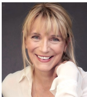
HARLEY JANE KOZAK – Lynn

Harley Jane Kozak was born in Pennsylvania, grew up in Nebraska, finished NYU School of the Arts Graduate Acting Program, and ended up in L.A. She's starred or co-starred in a few dozen feature films ( Parenthood , Arachnophobia , The Favor , etc.), three soaps, many commercials, countless plays and a whole lotta TV before taking a 15-year maternity leave and turning to a life of crime fiction. She's written five novels—her first, Dating Dead Men , won the Agatha, Anthony, and Macavity awards—and her short prose has appeared in Ms. Magazine , The Sun , The Santa Monica Review and eight anthologies, including Best American Mystery Stories of 2019 . Harley's still in Los Angeles, acting, writing, and producing and narrating audiobooks.