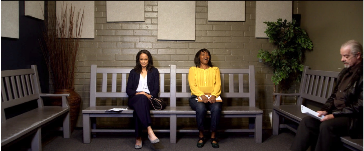
L-R: ANNE-MARIE JOHNSON as Jo, ERIKA ALEXANDER as Vanessa, JOE HART as Tony D